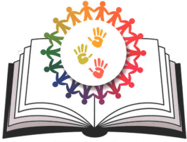
Writing the Next Chapter Together

“Sharing our stories, investing in the story, continuing the story.”